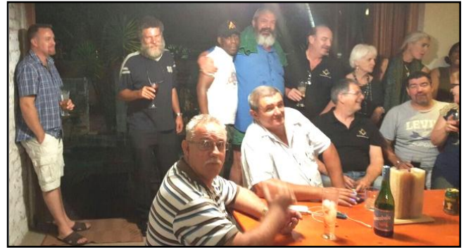
The party in full swing.

The trip had two objectives. Firstly, it was a focussed effort to assist a Lodge which is endeavouring to recruit new members. Secondly, it was an opportunity to cement the fraternal and social relationships between the Brethren of the Province. There is no doubt that a Province that “plays together, stays together”. Freemasonry has to be “fun” and socialising in a relaxed environment certainly goes a long way to allowing the Brethren to get to know each other. Any team works together so much more effectively when they know each other's strengths and capabilities and there is no better way to establish this knowledge than “ sharing time together in the pursuit of promoting the Order and enjoying harmless fun ”.