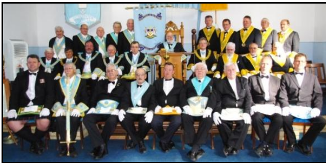
The Wor Master and Brethren of Lodge Diamond, with Grand Lodge, Provincial Grand Lodge and other visitors..

The Lodge building dates back many years and, with the help of the ladies, has been cleaned up and extended recently to provide a very practical facility.