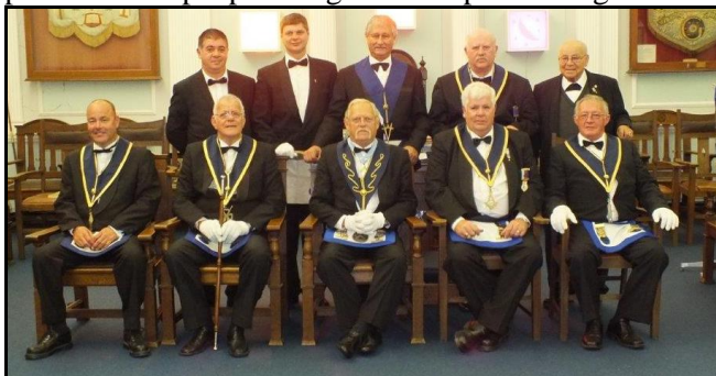
The Wor Master and Officers of Lodge Fidelity