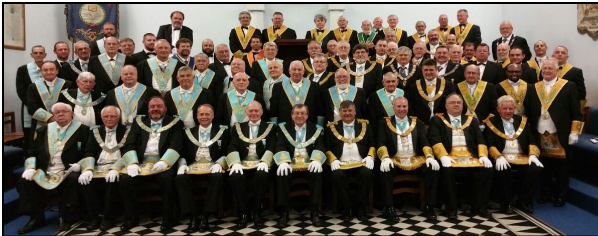
Die Broeders wat die Algemene Jaarvergadering van Sentrale Afdeling bygewoon het