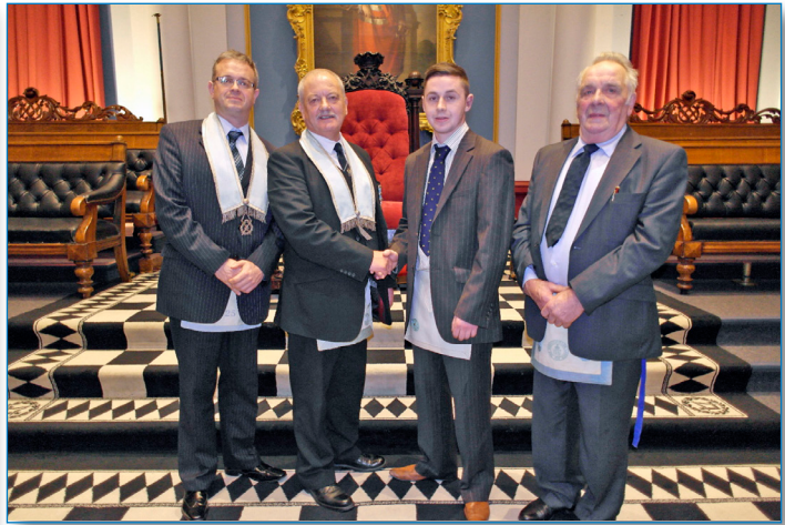
The Lodge Members who were in attendance along with the visitors who accompanied us.