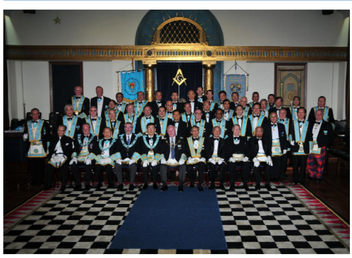
Members of the Provincial Grand Lodge of the Far East, Past & Present.