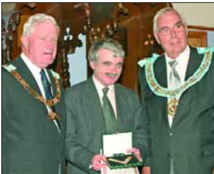
Presentation of Baal's Bridge Square to Minister.

In his opening address at the official ceremony, the Provincial Grand Master clarified that; "As our first