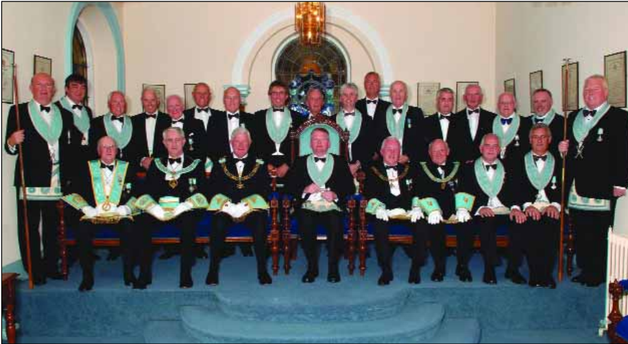
M.W. Grand Master and Brethren of Aberfoyle Lodge No. 784.

Aberfoyle Lodge No. 784 was constituted and dedicated on 21st June, 1956 at a Special Communication of the R.W. Provincial Grand Lodge of Londonderry & Donegal, held in the Freemasons' Hall, Bishop Street, Londonderry and celebrated its 50 years of Masonic Labour at the same venue on the 21st June, 2006.