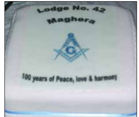
Above: The Cake.