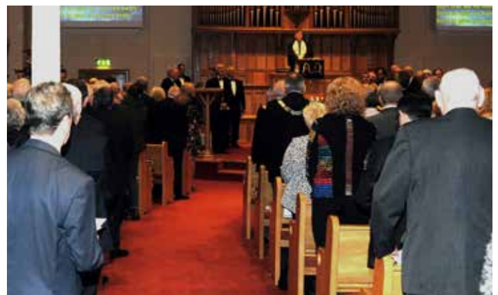
The Church was filled to capacity with Masons and their families