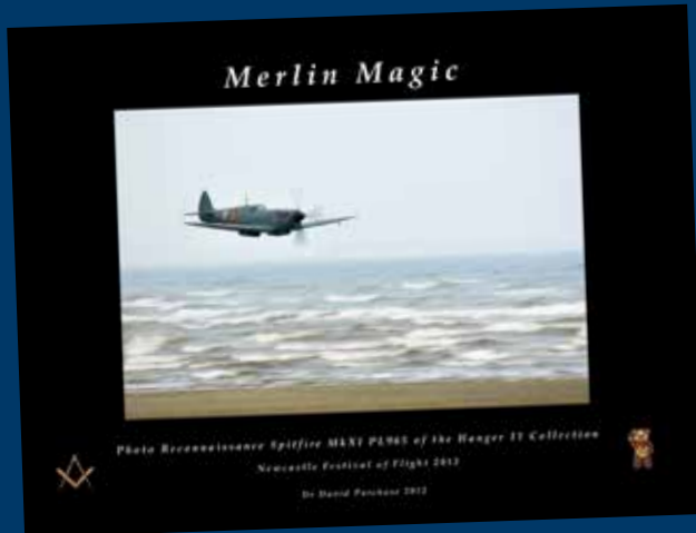
Merlin Magic - Spitfire Mk XI PL965 of the Hanger 11 Collection – at the Newcastle Festival of Flight 2012

Heading Home – Last of The Many – Canadian Lancaster VR-A and RAF Lancaster KC-A at the Portrush International Air Show 2014.