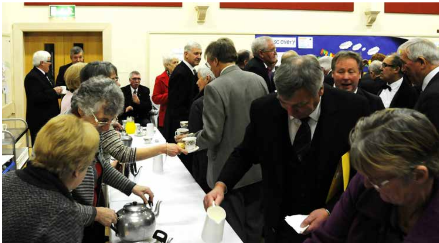
Tea in the Church hall