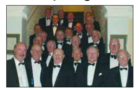
Pictured is the R. Wor. Provincial Grand Master of Down and Brethren of 381.

On 19th November 2004, County Masonic Lodge No. 381 celebrated its One Hundredth Anniversary with a night to remember at Royal Belfast Golf Club.