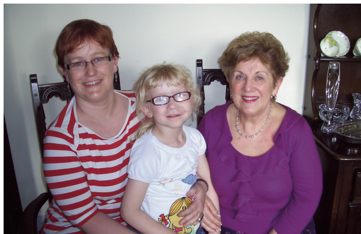
The 3 generations