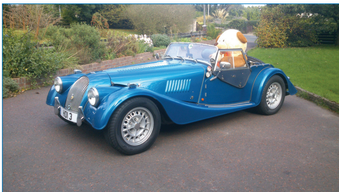
Ted does occasionally “travel in style”!

And we have already supplied over 7,500 Hospital Teds to the very grateful staff in the Emergency Departments. These teddies are given to distressed children where staff feel that this will help to calm the child and help them in their important work. These teddies are not for sale but they are for the young patients to keep and take home with them.