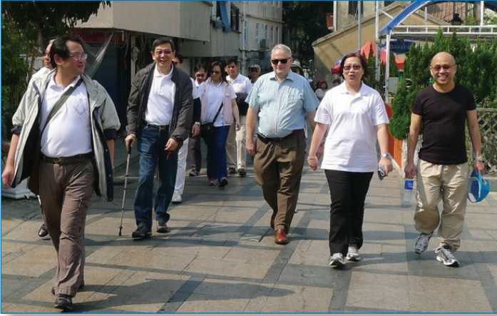
Irish brethren and supporters set out on the Walk for Charity

Every year the Freemasons of Hong Kong hold an annual appeal for the benefit of a local charity. Each of the three constitutions, English, Irish and Scottish, take turns to run the Appeal and in 2013 it was the turn of the Provincial Grand Lodge of the Far East, I.C. Brethren of the Province were asked to put forward charities for consideration. After a selection process the selected charity was Helping Hand, who run homes for the elderly in Hong Kong and China. They appealed for funds to renovate three of their six homes.