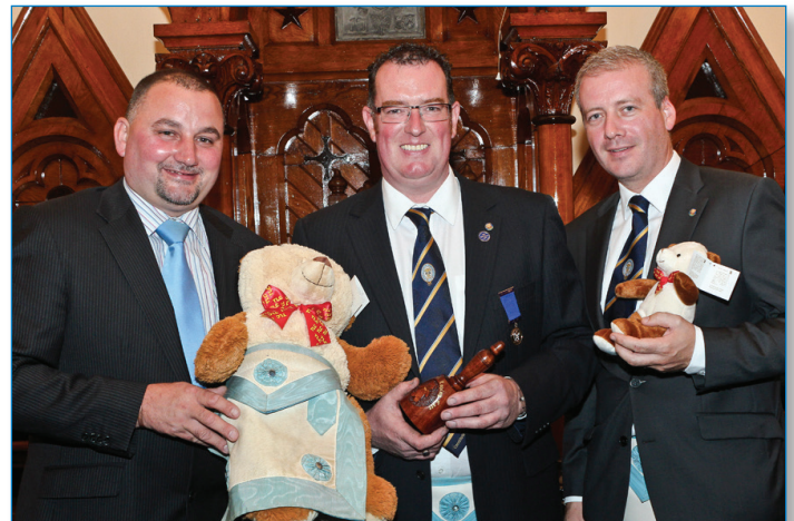
The Travelling Maul at Farmer's Friendship

Children admitted to Emergency Departments are usually frightened and see strange people who want to do strange things to them. Sometimes they are not even with their main carer. These children cannot, for reasons of infection control, bring their own cuddly toys with them. Their whole day has fallen apart, so the gift of a lovely cuddly Teddy helps the staff win the child's confidence and the distraction makes it easier for the staff to get on with any necessary treatment.