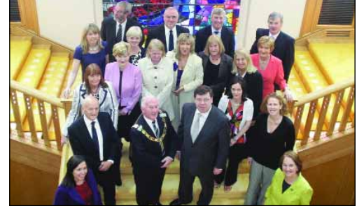
GM with Taoiseach in Government Buildings