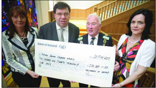
N. I. Children's Hospice.