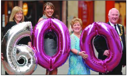
GM with Charity Representatives