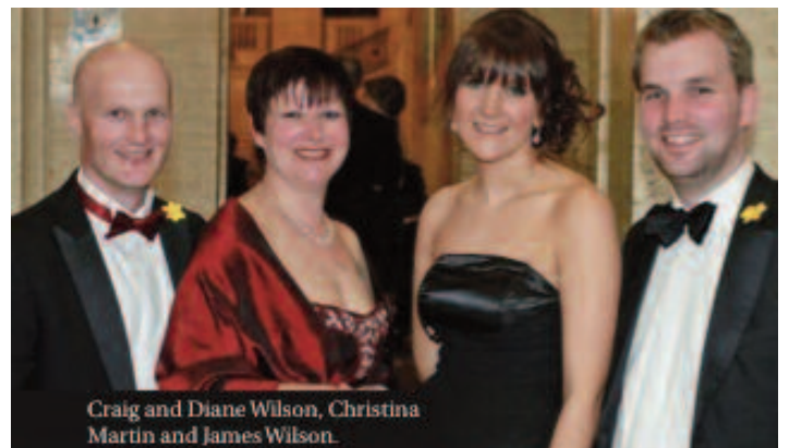
Pictured are the Organisers

The evening began with big band music of the Belfast Jazz Orchestra, which was followed by the Usual Suspects. Like most other