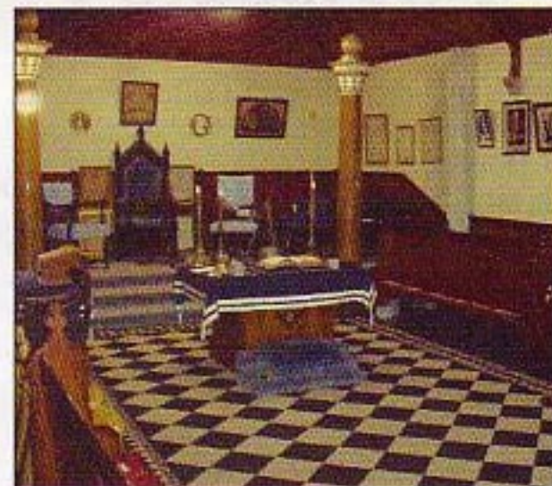
Lodge Room in Sligo.