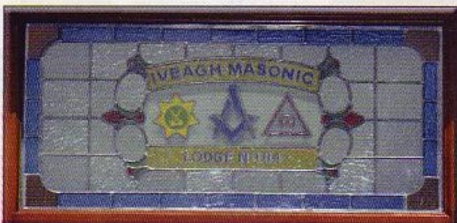
Window representing the lodges at Maralin.