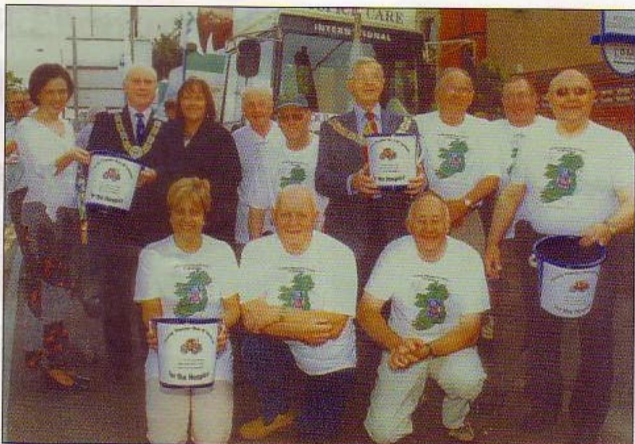
The A.G.M. and D.P.G.M. of Down with the fund-raising team and representatives from the Hospice at the send off at Newry Masonic Hall on 16 July 2003.