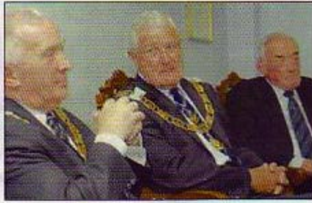
Deputy Grand Master, Grand Master and Provincial Grand Master of Antrim in Rosemary Street, Belfast.

Full page reports were subsequently published on the Monday issues of the morning papers and a short article in