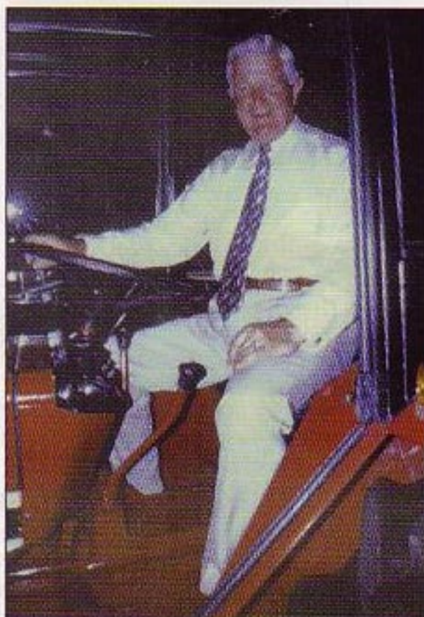
The Grand Master in Arklow.

Never again would we, in Newry Masonic Club, have to organise a Tractor Drive around Ireland.