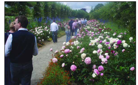
Pictured above are Brethren, wives, friends and family on a garden walk in Mount Congreve, Waterford in June 2008. This event raised €650.00.

On September 29th the "almost" nationwide quiz took place in conjunction with the Samaritans and in the Southern provinces we had 6 venues raising almost €14,000 between them. This event was in general well publicised through the media with thanks in the main to the Samaritans expertise and participation in each locality - Sligo, Waterford, Kilkenny, Limerick, Athlone and Galway. The positive media publicity for our Order within local communities was significant. With over 200 tables of 4 participating on the night, this means that the event was supported in person by some 800 people prepared