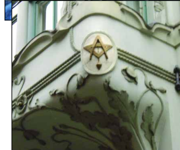
Left: An example of the Masonic symbols on buildings in the City of Riga.