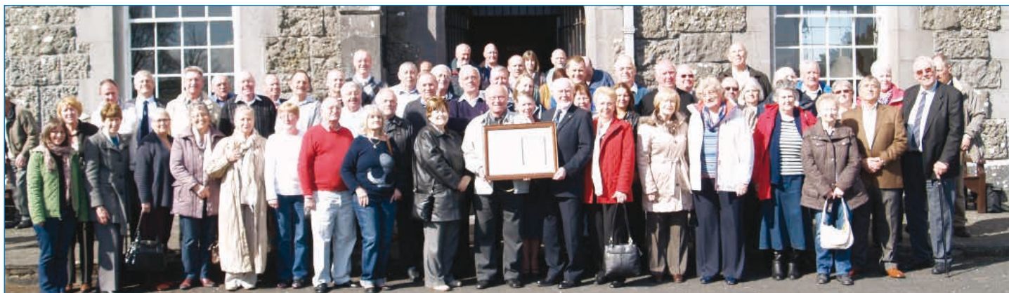
Masons & Guests outside Knappogue Castle with the PGM's of Antrim & North Munster holding a copy of the original Warrant of Lodge No. 60

The Harp & Crown Lodge No. 60 of Ballymena in the Province of Antrim recently undertook an excursion to North Munster for their annual installation proceedings.