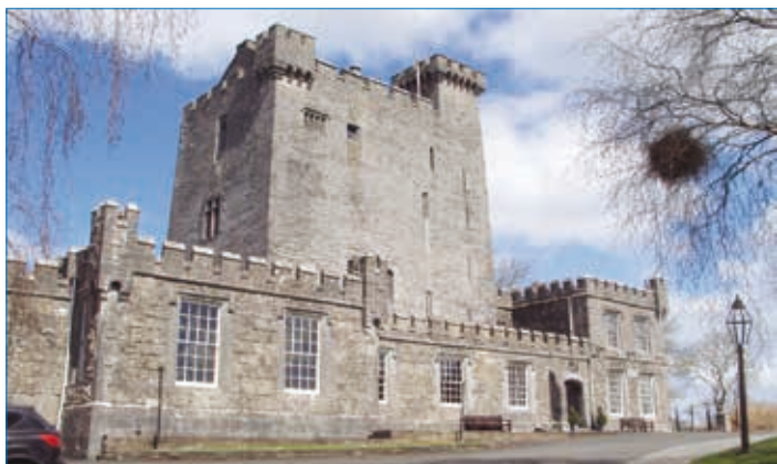
Knappogue Castle. Limerick Built Circa: 1467

As part of their continuing effort to engage with the 277-year old history of the warrant, the Brethren of Ballymena have been visiting the North Munster area for many years, making connections and developing relationships with their Limerick counterparts. In return the Province of North Munster has always attended the Annual Installation meetings in Ballymena.