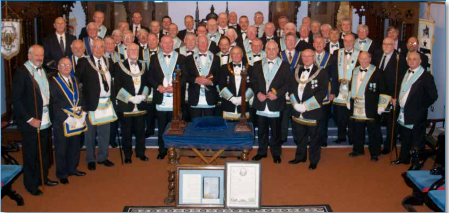
Brethren of Lodge 60 & Visitors on day of Installation

exemplary fashion to a very fresh faced looking 25 year-old Mason. Almost as impressive as the Degree work was the Festive Board afterwards - a hot & cold buffet complete with a selection of desserts. The welcome the visitors received brought the day to an outstanding end for all concerned.