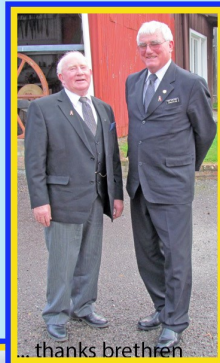
... thanks brethren