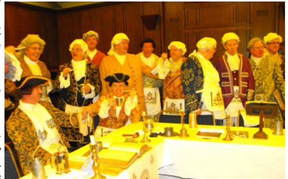
Members of the Burnley & Pendle 1759 Antient Ritual Demonstration Team