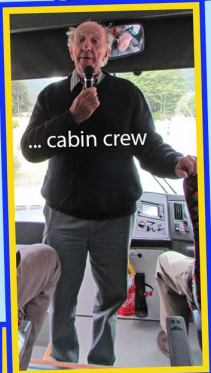
... cabin crew