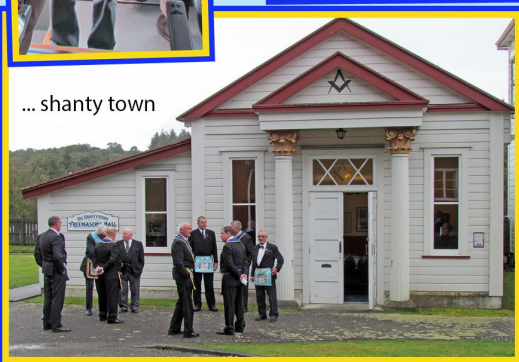
... shanty town