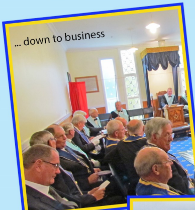
... down to business