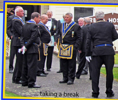
... taking a break