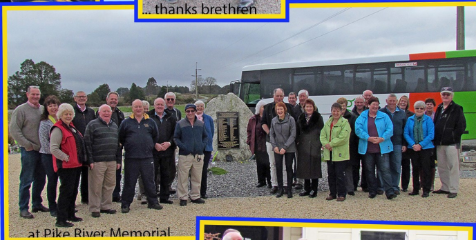
at Pike River Memorial