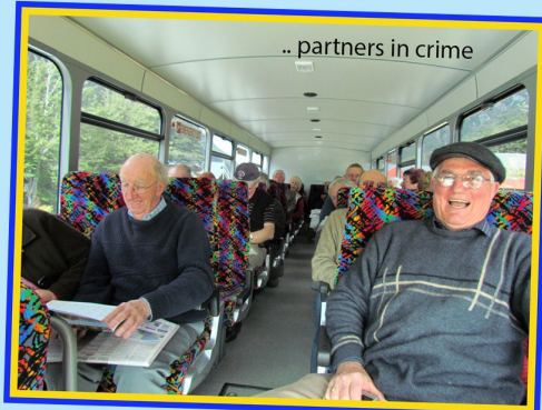
.. partners in crime