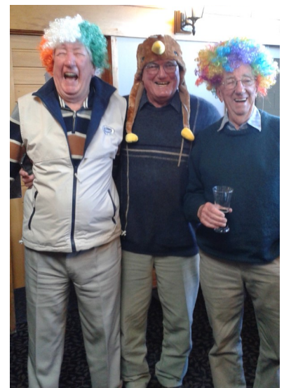
Three senior Freemasons bring a touch of sobriety to the proceedings at Greymouth.