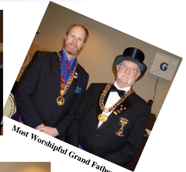
Most Worshipful Grand Father