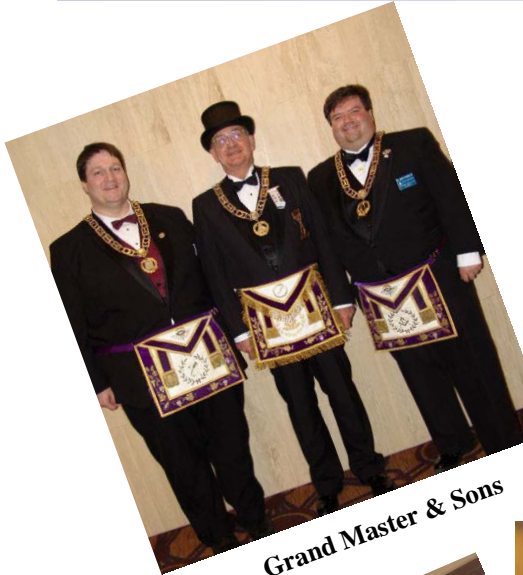
Grand Master & Sons