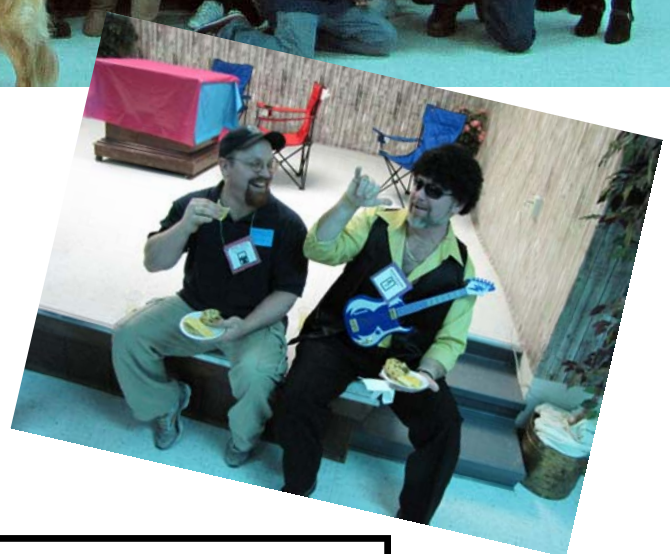
Cast and other participants from Tanana Lodge No. 3 Murder Mystery Dinner