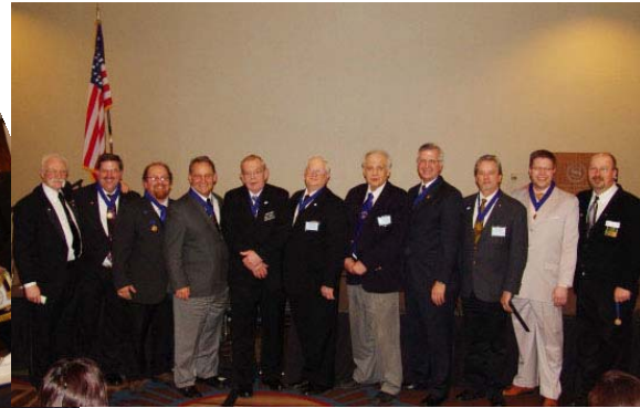
GM's Award of Excellence