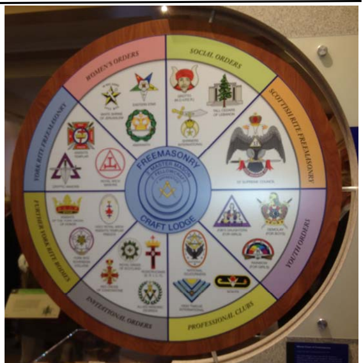
New logo showing the relationship between Craft Masonry and the Family of Freemasonry